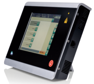
LEONARDO® DUAL 45/100